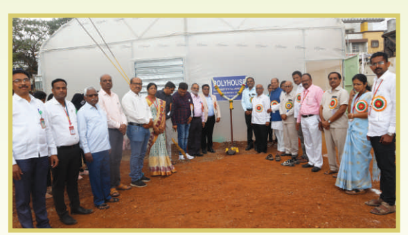
Polyhouse - Dept. of B.Voc. Agriculture