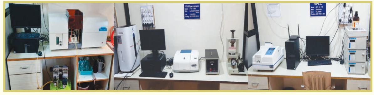
Common Facility Center (CFC)