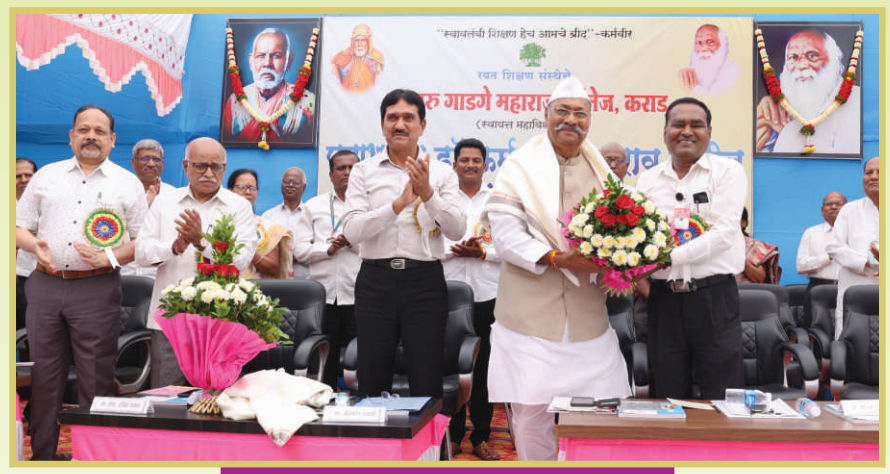
Karmaveer Jayanti 2023-24