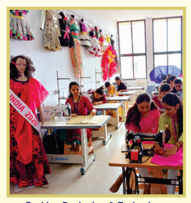
Fashion Designing & Technology