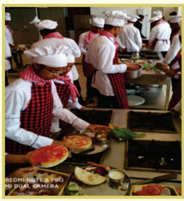
Hotel Management & Catering Technology